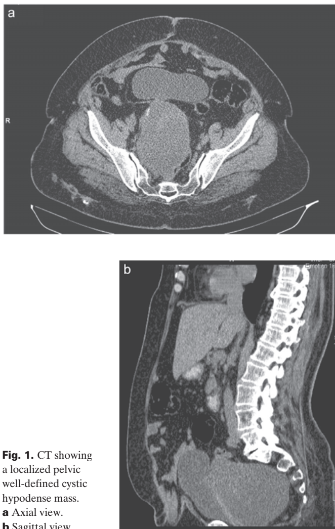
Fig. 1. CT showing a localized pelvic well-defined cystic hypodense mass. a Axial view. b Sagittal view.

The CT findings were confirmed during surgery. An encapsulated mass in the pelvic cavity was filled with mucinous material, and no solid implants or mucin were found in the free peritoneal cavity. The mucinous content was removed completely and intraoperative hyperthermic intraperitoneal chemotherapy (HIPEC) as well as postoperative intraperitoneal chemotherapy with 5-fluorouracil (5-FU) (750 mg/m 2 ) were performed for 5 postoperative days. Histological examination revealed disseminated peritoneal adenomucinosis according to Ronnett's classification (fig. 2) [3]. The postoperative course was uneventful. The patient was scheduled for close follow-up and showed no relapse as well as normal levels of CEA and CA 19-9 at 24 months.