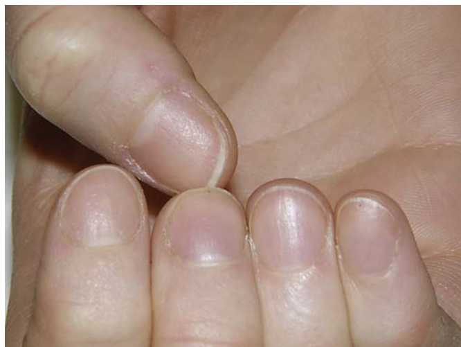
Fig. 2. Trachyonychia: nails are thin and rough due to excessive longitudinal ridging. Severity varies in different nails. Also, note the mild koilonychia, onychoschizia in the thumb, and ragged hyperkeratotic cuticles.