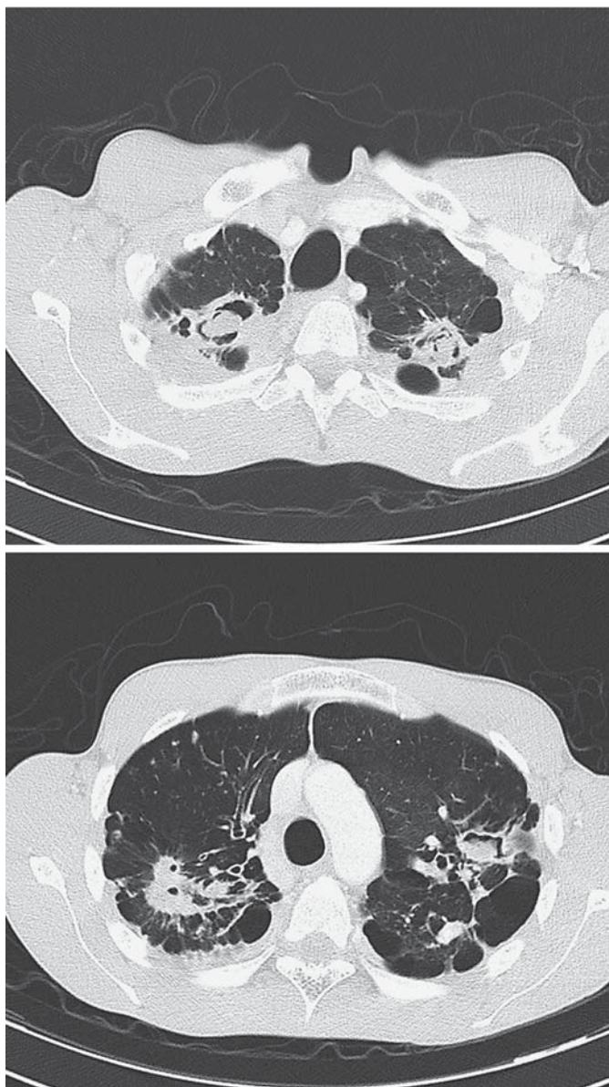
Fig. 2. CT of the chest confirmed marked structural lung disease with UL predominance. Numerous cavities and intracavitary bodies indicating aspergillomata were present.

Our patient had an unremarkable stay in hospital and was discharged without complications. At a follow-up 3 months after the procedure, he reported absolutely no haemoptysis. Moreover, he was subsequently employed as a manual labourer. His pulmonary function testing confirmed significant improvement ( FEV_1 = 1.40 liters (34.2%), FVC = 2.0 liters (41.5%) and 6-min walking distance = 535 m). This functional improvement was still present at the 6-month follow-up, when he once again reported no stent-related complications or haemoptysis.