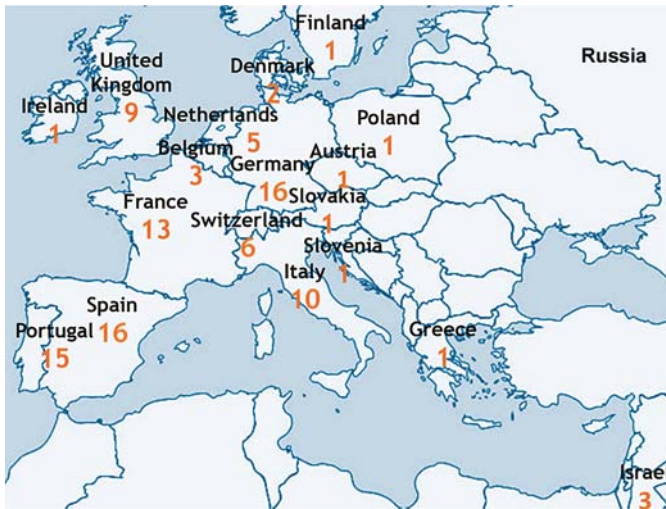
Fig. 1. Number of members per country.