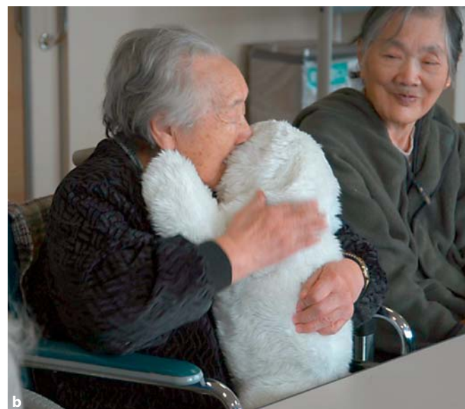
Fig. 3. Elderly people (a) speaking and stroking and (b) hugging and kissing the seal robot, Paro .

liveliness and cuteness in the robot; actual baby seal calls were sampled and used.