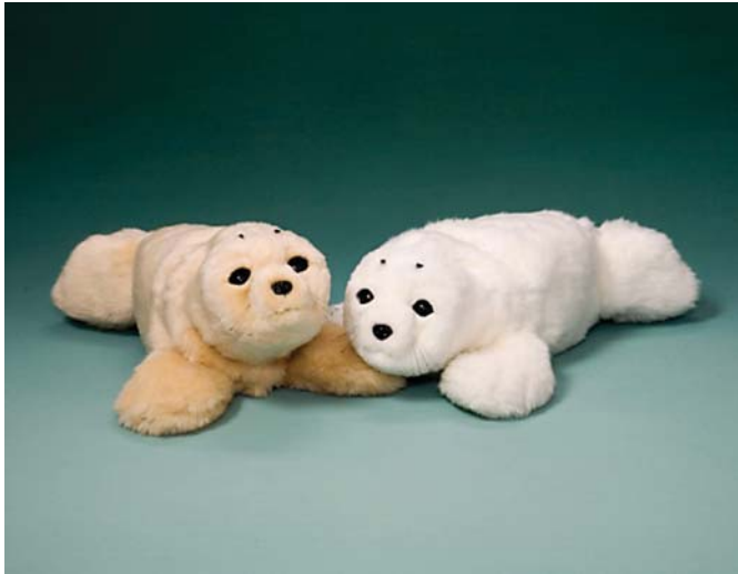
Color version available online