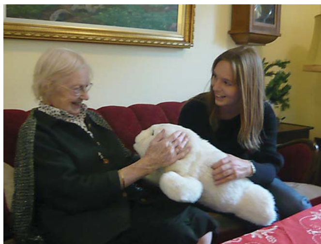
Fig. 4. Social mediator, Paro, between elderly person and caregiver.

Various robots have been developed and are being introduced in our lives as commercial products. Each robot is designed for a specific purpose. The seal-type mental commitment robot, Paro, whose goal is to enrich daily life and heal human minds, is designed to maintain long-