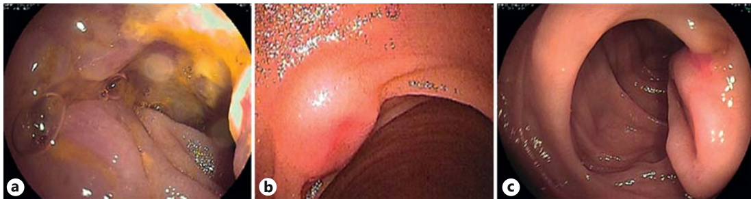
Fig. 2. Small bowel tumors. a Adenocarcinoma of the jejunum. b NET of the ileum. c Typical GIST with large groove in the center.

oscopy, push enteroscopy, intraoperative endoscopy, or radiologic techniques such as enteroclysis, computed tomography (CT) enteroclysis or magnetic resonance enteroclysis. Capsule endoscopy has proved to be useful for the evaluation of the small bowel in patients with polyposis syndromes, also when compared to other imaging methods such as magnetic resonance imaging, CT enterography and push enteroscopy [11].