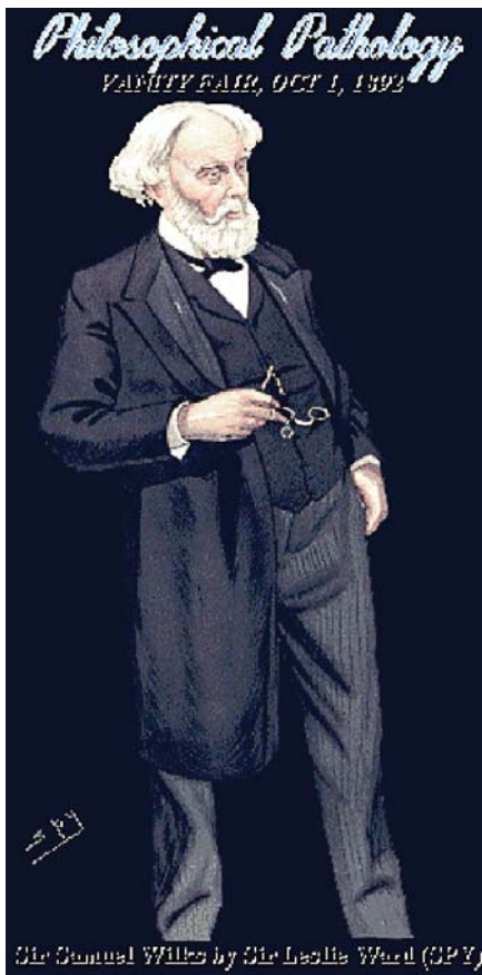
Fig. 2. Sir Samuel Wilks, 'Philosophical Pathology', Spy print, 1892.