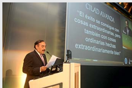
Opening Ceremony CILAD XIX Congress Seville