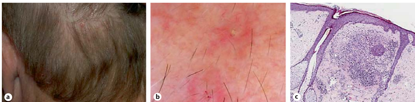
Fig. 1. Rosacea of the scalp (patient 1). a Clinical presentation. b Dermoscopic finding. c Histology. HE.