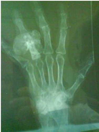
Fig. 1. Radiograph showing chondrosarcoma of the proximal phalanx of the fourth digit. The tumor destroys the cortex and extends into soft tissue.