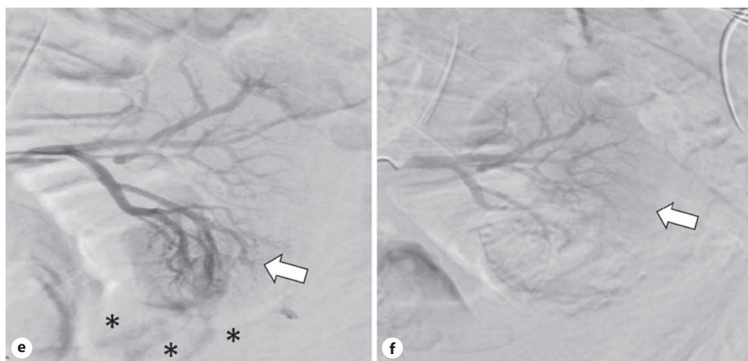
Fig. 2. e Pre-embolization arterial phase angiogram showing a hypervascular blush (arrow) in the right inferior renal pole with active contrast extravasation extending inferior to the kidney in multiple streams (asterisks). f Post-embolization arterial phase angiogram showing normal vascularization of the upper pole of the left kidney and hypovascularity of the lower pole (arrow) without active contrast extravasation.

abdominal imaging prior to starting anticoagulation is not commonly practiced. AML is a rare tumor, with a prevalence of 0.2–0.6% in the general adult population [13]. Hence, data on the number of bleeds from these occult tumors after starting anticoagulation is limited. Furthermore, there is no evidence on withholding anticoagulation even if an incidental AML is identified.