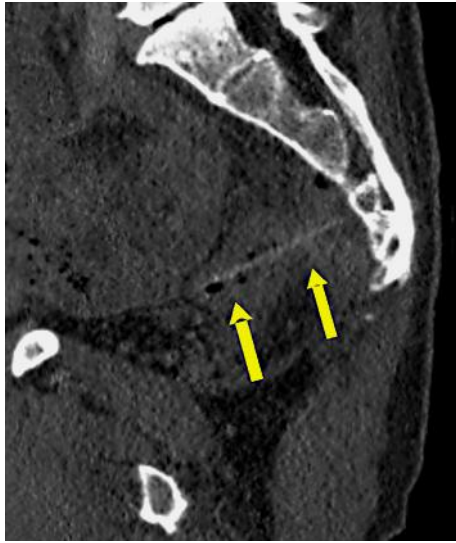
Fig. 1. CT scan showing a rectal perforation caused by a foreign body. The arrows indicate the toothpick perforating the rectum.