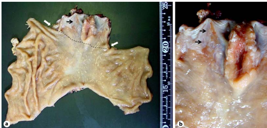
Fig. 2. a Gross image of the resected sample. The tumor was mostly localized proximally to the esophagogastric junction and the cardiac notch, which is presumptively depicted by the broken line and the white arrows, respectively. b Close-up image around the esophagogastric junction. As seen in endoscopy, short-segment Barrett's epithelium was observed near the tumor (black arrows), with intestinal metaplasia and submucosal esophageal glands histologically confirmed.