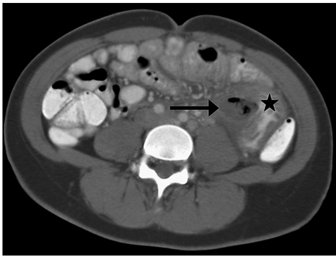
Fig. 1. A CT scan of the abdomen and pelvis demonstrated a thickened loop of jejunum (star) in the left abdomen with an adjacent air-fluid-filled mass (arrow) measuring 2.9 cm in the largest diameter.

All the authors listed declare that there are no conflicts of interest and that they accepted no financial sponsorship in producing and presenting this article.