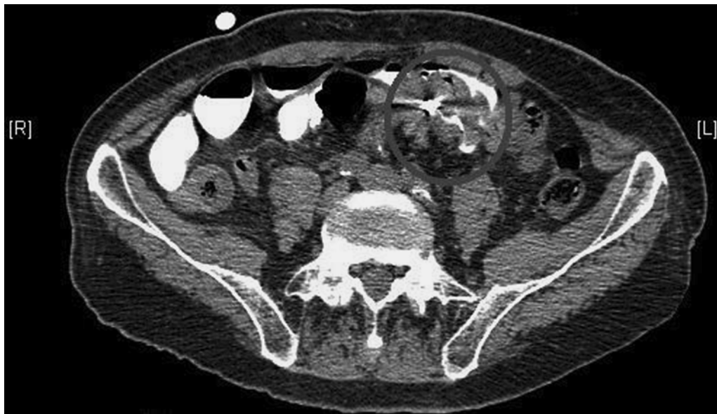
Fig. 1. CT image of the lower abdomen showing the tip of the enteroclysis catheter surrounded by intussuscepted jejunal folds (circle). No obstructive pathology was revealed by means of the CT scan, besides the fact that the catheter had progressed very deeply into the small bowel.

The present case shows the usefulness of the double-balloon enteroscope to remove a strangulated enteroclysis catheter from the jejunum, avoiding urgent surgical intervention.