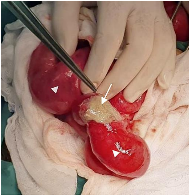
Fig. 4. Intraoperative image. The tip of the inflamed appendix was dilated, and pus spilled out (arrow). The small bowel loops were adhered to the appendix and dilated, with no sign of necrosis (arrowheads).