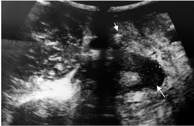
Fig. 2. US of the right hypogastric region. Echogenic of the partial appendicolith (short arrow); the tip of the appendix is dilated, filled with pus in the lumen; wall thickness (long arrow); periappendiceal fat stranding.