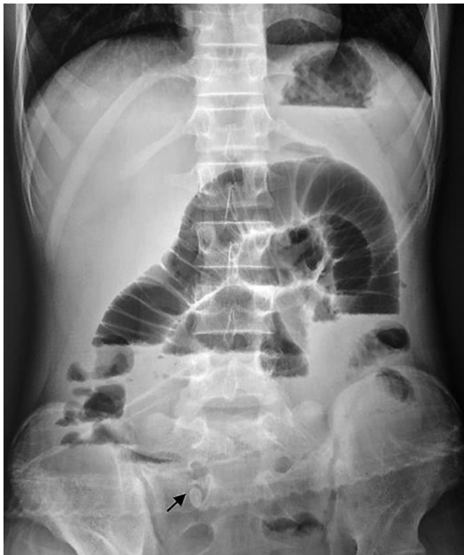
Fig. 1. Abdominal X-ray demonstrating multiple air-fluid levels and distended loops of the small intestine. Pelvis appendicolith (arrow). Note spina bifida occulta s1.