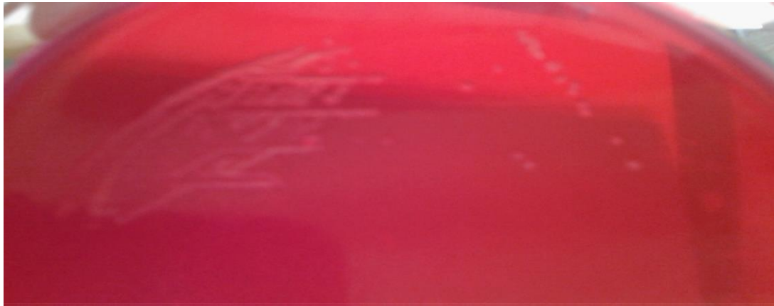
Fig. 3. C. testosteroni growth on highly selective and differential medium for gut pathogens. Xylose lysine deoxycholate agar showing red colonies.