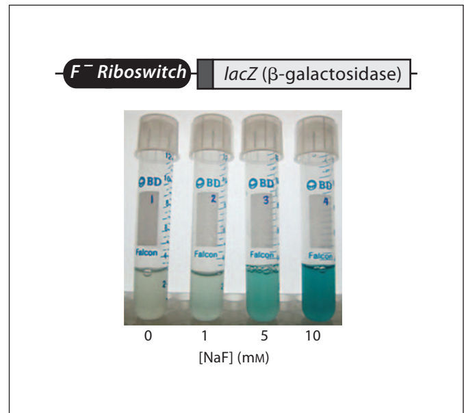
Fig. 2. Control of \beta -galactosidase reporter gene expression in E. coli by a fluoride-responsive riboswitch from Bacillus cereus . Reporter construct (top) and Miller assay analysis (bottom) were as described previously [Baker et al., 2012].

es the folding of the riboswitch and these structural changes either activate or inhibit expression of the adjacent gene. In most instances, riboswitches turn off the expression of genes that make or transport the metabolite that is sensed by the RNA. When cells have sufficient metabolite, they save energy by sensing its abundance and deactivating expression of genes whose protein products would otherwise make or import more. However, there are some riboswitches that activate gene expression when they bind a ligand. For example, riboswitches that activate expression have been demonstrated to respond to glycine [Mandal et al., 2004], the bacterial second messenger c-di-GMP [Sudarsan et al., 2008; Lee et al., 2010], and adenine [Mandal and Breaker, 2004]. In the latter case, adenine binding occurs when this compound accumulated to toxic levels, which induces expression of a