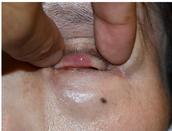
Fig. 1. Photograph of the patient's face. A mass is located in the upper eyelid margin without evidence of madarosis. The mass is pinkish with a relatively smooth surface.