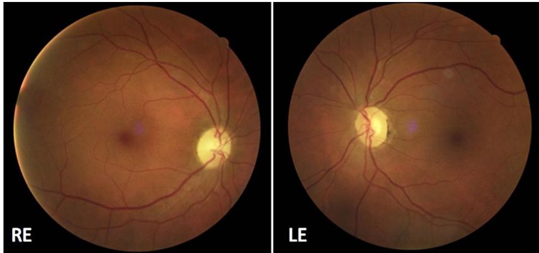
Fig. 1. Fundoscopy showed a C/D ratio of 0.3 in the RE and of 0.4 in the LE as well as bilateral optic disc pallor.