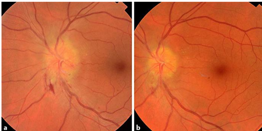
Fig. 1. a Fundus photograph. Posterior pole of the left eye demonstrates marked swelling of the optic disc with peripapillary hemorrhage. b Fundus photograph. Posterior pole of the left eye 2 weeks after initiation of antimycobacterial therapy shows marked resolution of the optic disc swelling.