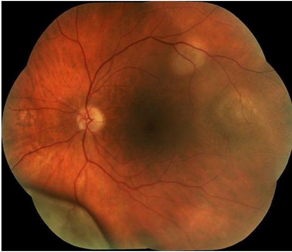
Fig. 1. Fundus picture of choroidal tumors in the left eye.