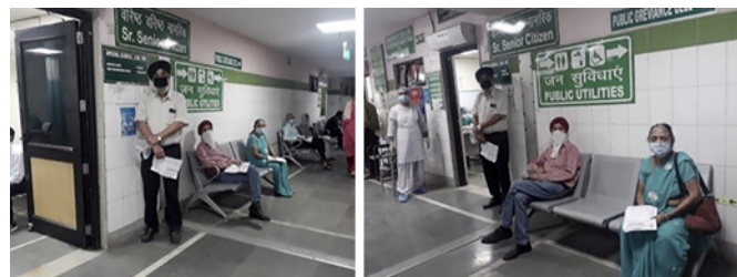
Fig. 2. Social distancing is the new order in the OPD waiting areas with a restricted number of patient attendants. OPD, outpatient department.