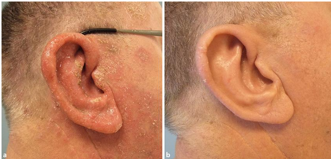
Fig. 2. Nummular eczema with secondary infection. a Baseline; erythematous nummular lesions forming confluent plaques covered with crustae and swelling of the ear. b Six weeks later; very mild erythematous macula with minimal scaling.