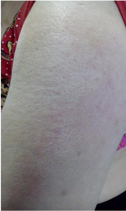
Fig. 4. Scleromyxedema. Sclerodermoid papules are seen on the arm.