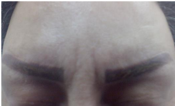
Fig. 1. Scleromyxedema. Thickening of the skin of the forehead leading to furrows and folds.