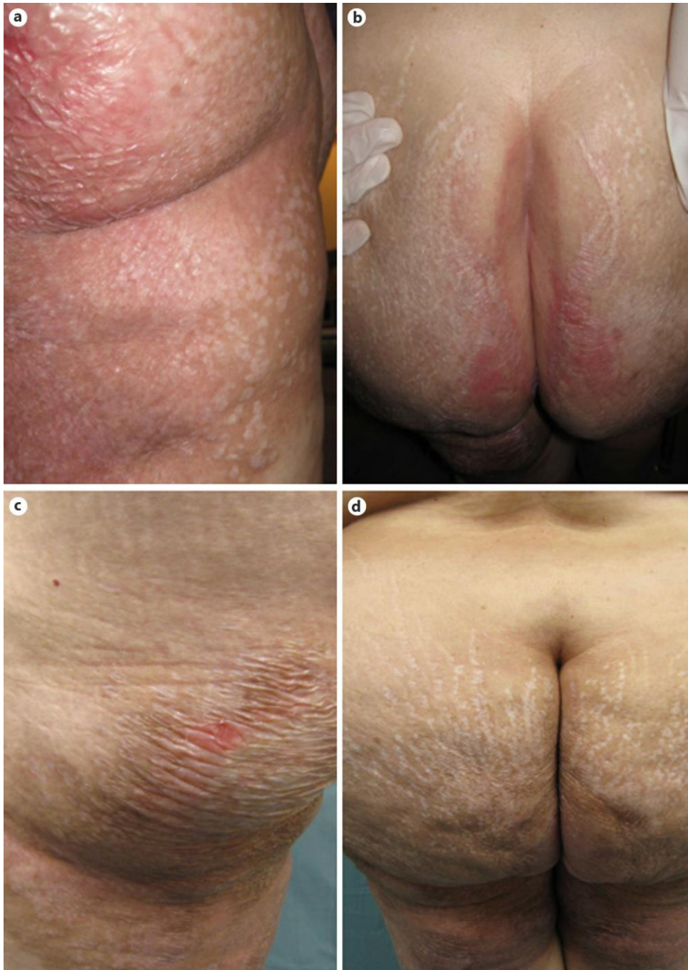
Fig. 1. a, b LS plaques just prior to initiating ketamine infusion on the upper thigh ( a ) and intergluteal cleft ( b ) of the patient. c, d The patient's upper thigh ( c ) and intergluteal cleft ( d ) 2 months after ketamine infusion.