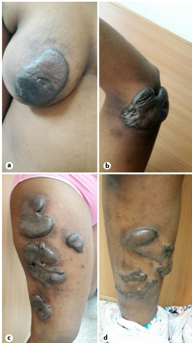
Fig. 1. Irregularly shaped hyperpigmented slightly erythematous nodules with a shiny, smooth surface over the right breast (a), left elbow (b), right thigh (c) and right lower limb (d).