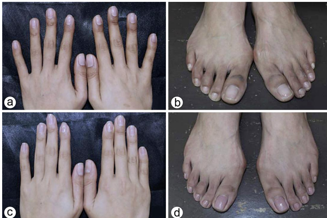
Fig. 1. Hyperpigmentation of both hands and feet. Initially, the patient showed multiple asymptomatic hyperpigmented macular patches over the dorsa of the fingers (a) and toes (b). After about 1 month of vitamin B12 (cyanocobalamin) therapy, the pigmented lesions showed considerable improvement (c, d).