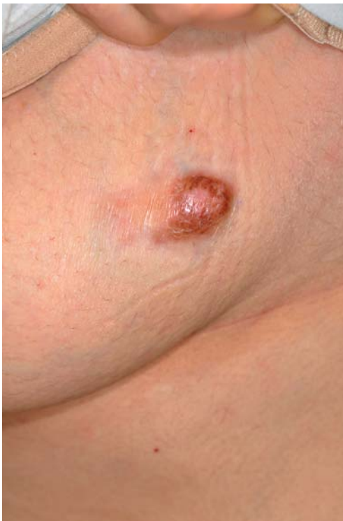
Fig. 1. Brown-colored, elastic hard, well-demarcated nodule on the left side of the breast. The tumor mass was 35 × 50 mm in size.

Supportive therapy for DFSP is still limited. Kerob et al. [5] assessed the treatment of 25 cases of nonresectable DFSP patients with imatinib mesylate. In their report, although imatinib mesylate targets PDGF- \beta and can be effective for DFSP, a clinical response was achieved in only 36% of cases. The authors concluded that other reagents to treat nonresectable DFSP are necessary [5]. Our present report sheds light on the suppressive effect of GCs on the development of DFSP, which could lead to therapeutic use of GCs, although in vitro studies regarding the effect of GCs on the growth of cultured DFSP are a prerequisite.