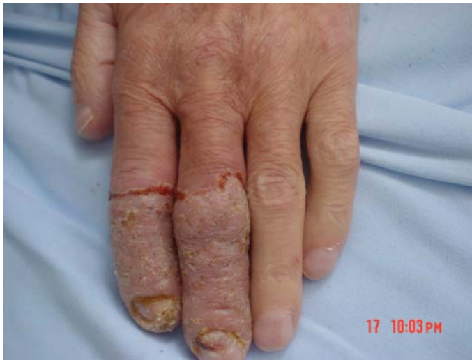
Fig. 2. Well-defined erythematous, crusted and vegetating plaques on the fingers.