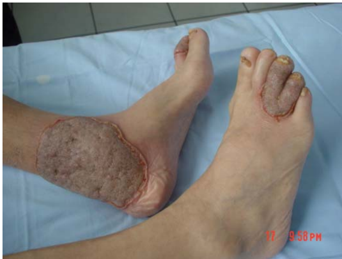
Fig. 1. Circumscribed vegetating plaques with erythematous elevated borders on the toes and medial malleolus of the left foot.

PV has a good prognosis with therapy. Its evolution tends to follow the progression of the underlying intestinal disorder [11]. It is important to be familiar with this vegetative skin condition, as correct diagnosis may lead to the uncovering of inflammatory bowel disease. The management of PV includes several agents, but definite guidelines are still lacking.