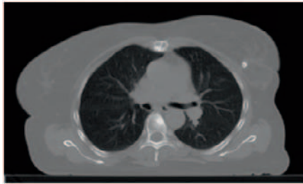
Fig. 4. Outcome 3 years after BCS and IORT. Imaging changes like calcifications are typically more pronounced after APBI as compared to standard WBRT without compromising cosmesis.