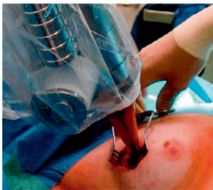
Fig. 2. IORT during BCS using the Intra-beam® system (Carl Zeiss Meditec, Oberkochen, Germany).

Elderly patients with small, invasive ductal breast cancer were included into the prospective TARGIT-E trial (NCT01299987). The rationale of this non-randomized single-arm study was to