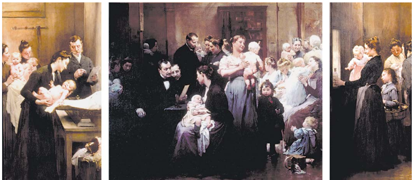
Fig. 3. The goutte de lait at Belleville Dispensary, Paris, opened in 1892. Painting by Jean Geoffroy [50], 1901. Triptych: weighing (left); consultation (center); milk distribution (right).